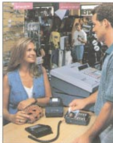
P8F shown in retail situation with T7E Terminal and CS70C Signature Capture PIN Pad

Additionally, both printers provide quality receipts in a new compact, quiet design. P8 printers are powered by the terminal, eliminating the need for a separate power supply and outlet.